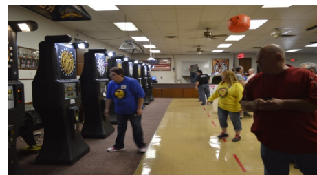
State Dart Tournament 2017

Check Us Out On Facebook @ Holdrege Eagles Club